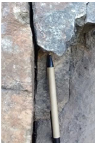
Figure 3: Apertures in the discontinuities present in the rock mass.

The rock that constitutes the rock mass marginal to highway BR-356, is gnaiss of fine to average granulometry, with milimetric to centimetric bundles with felsic and mafic layers that sometimes are folded. The mineralogy is predominantly quartz, feldspar and biotite.