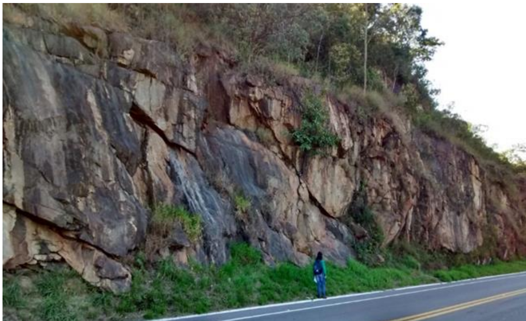
Figure 4: Slope study in the Rodovia dos Inconfidentes (BR-356) with highlight for the formation of blocks.

The geological hammer test was used in the rock mass with the objective of intact rock compressive strength on the classification proposed by ISRM in 1981. The hammer test was applied to several points of the rock mass presenting similar results with flakes after successive hammer blows, resounding when struck by the hammer. The rock mass was classified as R6 implying an extremely high resistance, bigger than 250 MPa.