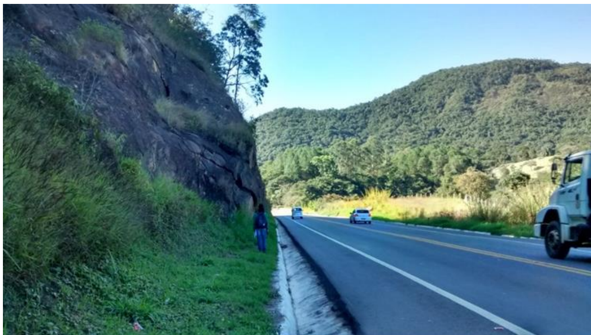
Figure 5: Marginal slope to BR-356 highway with its discontinuities.

The parameters that most influenced the susceptibility to rockfall in this slope was a favorable orientation to the formation of blocks and signs of activity. The signs of activity were identified directly in the field, from fallen blocks, fractures in the rock mass, open and displaced joints and presence of vegetation between the discontinuities. Figure 5 shows the studied slope, as well as its discontinuities.