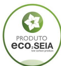
Figure 2: Eco2SEIA Product - Eco-Label

At the same time, producers who are interested in having the eco-label as an enhancing characteristic of their products, will undertake this commitment with environmental promotion, important and recognized by the markets, the urban market in particular, throughout the region.