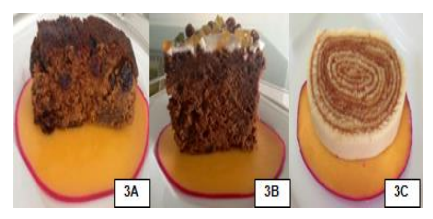
Picture 3A, 3B and 3C: Kingdom cheese on the composition of desserts.

port wine, almonds and after baked, receives an icing marble cover; that takes the beaten eggs whites, lemon juice and a large amount of sugar. Observing Picture 3 C, we have the composition of Kingdom cheese along with the roll cake (bolo de rolo), which has the following ingredients: sugar, butter, eggs, flour, guava jelly. The wedding cake and the roll cake (bolo de rolo) are traditional confectionery delicacies from Pernambuco (CAVALCANTI, 2010).