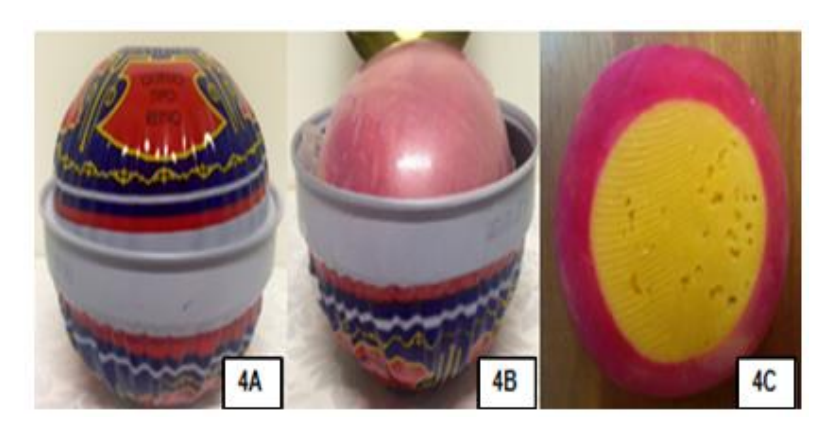
Pictures 4A, 4B and 4C: packaging and presentation of the Kingdom cheese.

The RIISPOA of the Ministry of Agriculture, Livestock and Food Supply, complements the information defining the Kingdom cheese must have a weight between 1.8 to 2.2 kg, spherical and properly matured for a minimum of 2 months. In both standards the Kingdom cheese is defined as "Kingdom cheese" for authorization of production and marketing in Brazil, as we observed in Picture 4A (BRASIL, 1996).