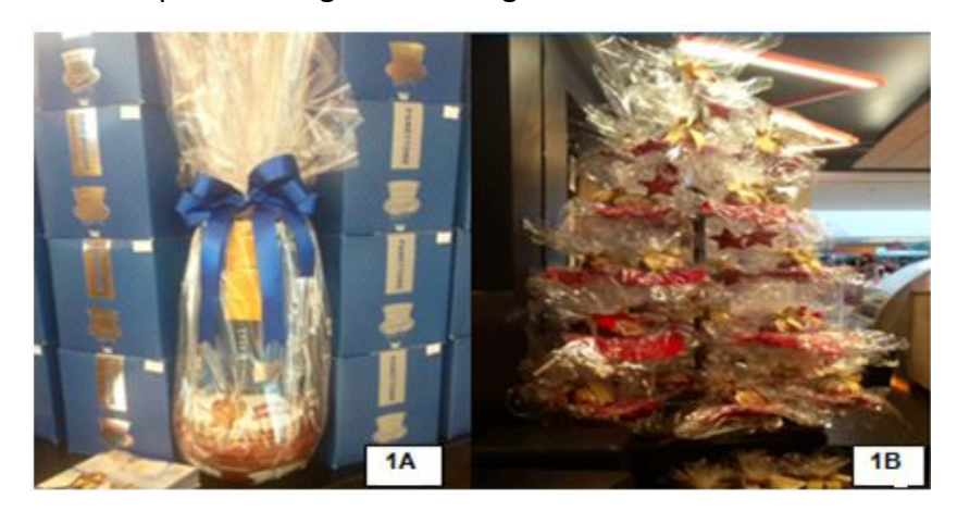
Pictures 1A and 1B: Kingdom cheese sold during Christmas time in Pernambuco.

The choice of desserts was based on tradition of weddings, baptisms, birthday, and in particular for the events of St. John and Christmas, when the Kingdom cheese is a mandatory item in this moment of important religious meeting and brotherhood.